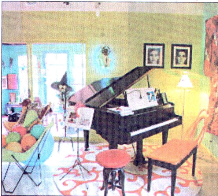
Artist Candice Gawne, who is known for her unique style of glass and neon artwork, opened her home for the tour.

Guests discovered unique structures, such as the Wilbur Wood House with a 180-degree harbor view that was moved by horse cart to its current location and a beach cottage transformed by works of neon art.