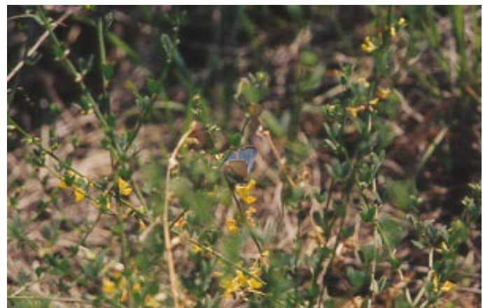
PV Blue butterfly enjoys a deerweed lunch at the Fuel Supply Depot.