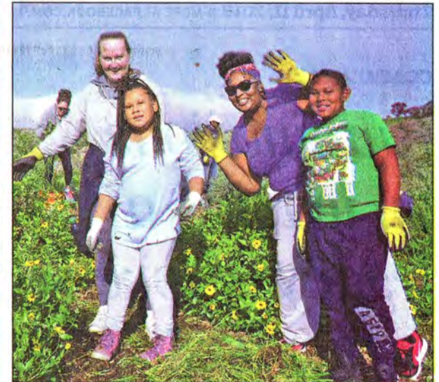
Palos Verdes Land Conservancy's Earth Day celebrations begin on April 20, 2019 with wildflower planting, guided tours, art activities and a native plant sale.

Academy Award nominated National Geographic documentary "Free Solo" will screen at the Warner Grand Theatre in San Pedro on April 20, 2019 at 5 p.m. as part of PVPLC's Earth Day celebration.