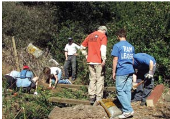
Volunteer Team Leaders learn trailbuilding skills at the Forrestral Ecological Reserve.

The Team Leader and KEEPERS (Keeping an Eye on the Preserve for Ecological Review) are off to excellent starts. We have nine KEEPERS to steward several different Preserves, which will help the Conservancy to address important issues on the different