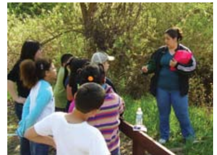
Children with a parent volunteer on a nature walk at George F Canyon.

The 3rd Grade program is completing its 12th year in 2007 with 1600 children participating. Howard Wood Elementary School in Torrance was added this year, bringing our total to 19 schools (80 classrooms) where 15 docents teach natural history.