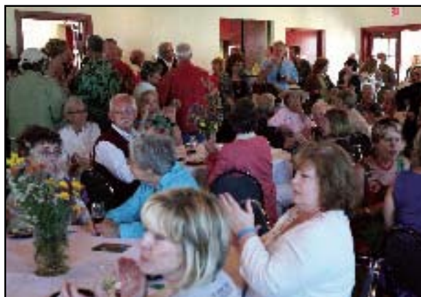
The Spring for White Point Home Tour Committee organizes an annual event that raises funds to benefit the White Point Nature Preserve by opening up some of the most unique homes in San Pedro to more than 200 people.

The accomplishments we've described are made possible because of the strong support of our community, the many individuals, families, foundations and corporations who gave so generously to the Conservancy. We also appreciate the outstanding community support for our fund raising events.