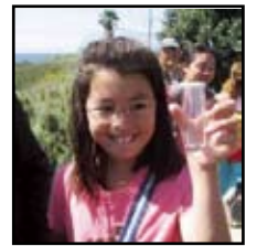
4th grader examines local flora on a science field trip.