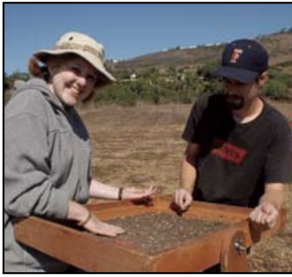
CSU students inspecting samples.