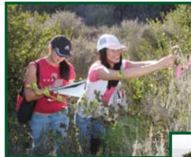
At left, high school students learning to band lemonadeberry. Below, students from South High in Torrance planting at White Point Nature Preserve.