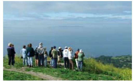
Nature walk participants take in the view from the slopes of the Portuguese Bend Nature Preserve.

We could not exist without the outstanding volunteer and financial support that we receive from the community. The Conservancy really is people – paid