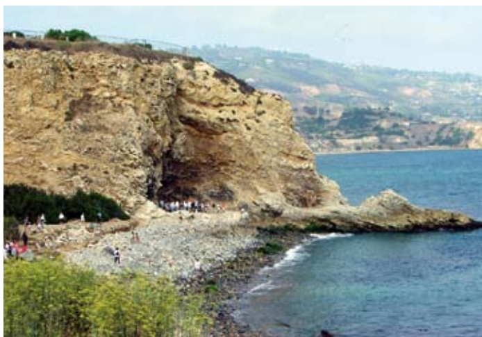
Above left, nature walk participants exploring a sea cave at Long Point. Above right, the first annual "Bark and Boo" at White Point Nature Preserve was a howling success that drew over 150 participants and their pooches.