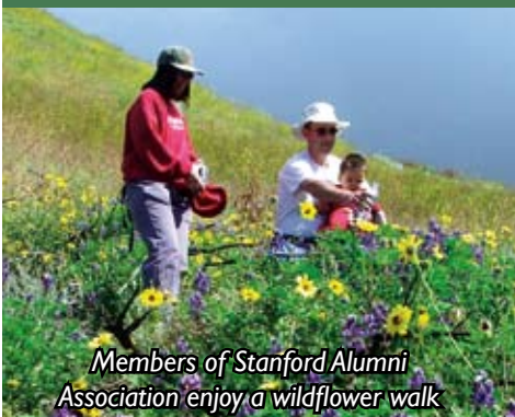
Members of Stanford Alumni Association enjoy a wildflower walk