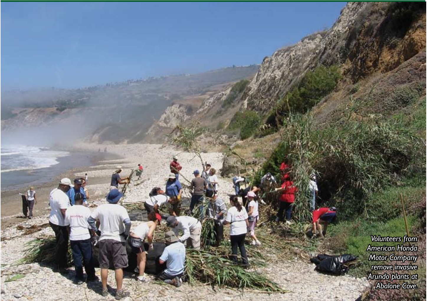
Volunteers from American Honda Motor Company remove invasive Arundo plants at Abalone Cove.