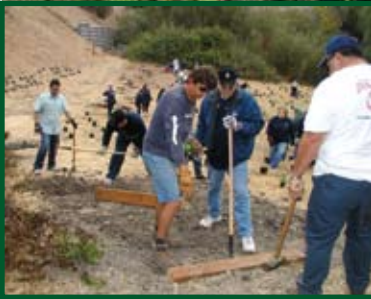
Above, biological survey work at Alta Vicente Ecological Reserve.

Above, Alcoa volunteers build new trails at George F Canyon Preserve. At right, improved habitat at the White Point Preserve has lured new residents such as the burrowing owl, rock wren, and savannah sparrow.