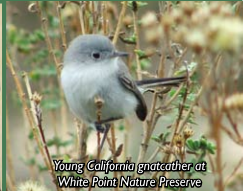
Young California gnatcatcher at White Point Nature Preserve