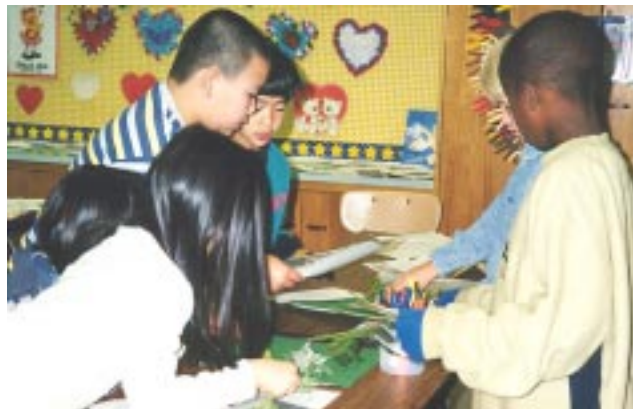
Students involved in classroom project.

The program includes four in-class sessions plus a field trip. In-class sessions cover various topics of natural and cultural history of the Peninsula. Special emphasis is placed on native and non-native mammals, birds and reptiles found locally. Species of interest include the gray fox, the soaring red tail hawk and the swift blue belly western fencepost lizard.