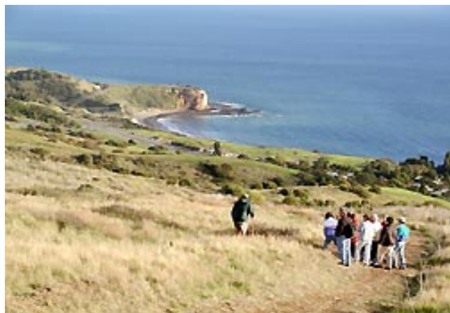
Participants at our February 10 Nature Walk enjoy views from Parcel 4.