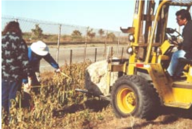
Boulder is placed as part of beautification effort.