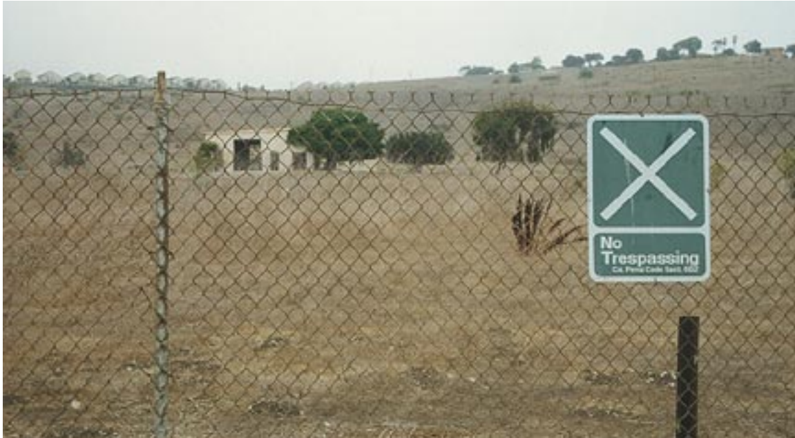
A view of the White Point property from Paseo Del Mar. Future enhancements include removal of the chain link and improved public access to this newly preserved area.