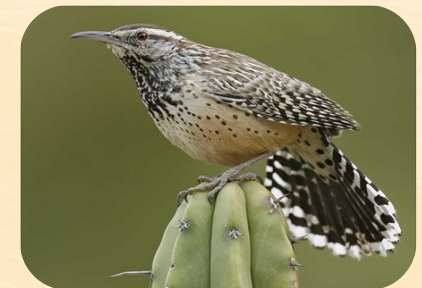
Cactus Wren (Protected Species)